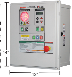
Integrated Control Panel Shown (Standard Size)

WARRANTY: All PowerHold vehicle restraints feature a full two (2) year base warranty on all structural, hydraulic and electrical parts, including freight and labor charges in accordance with Systems, LLC's Standard Warranty Policy. Structural components carry an additional three (3) year extended warranty with parts and labor. Systems, LLC warrants all components to be free of defects in materials and workmanship, under normal use, during the warranty period. This base warranty period begins upon the completion of installation or the sixtieth (60th) day after shipment, whichever is earlier.