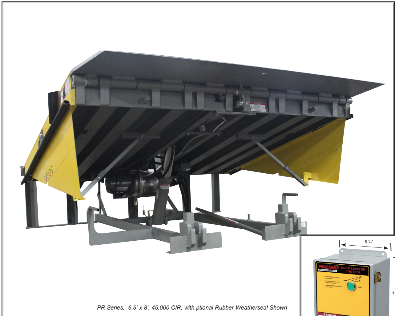
PR Series, 6.5' x 8', 45,000 CIR, with optional Rubber Weatherseal Shown