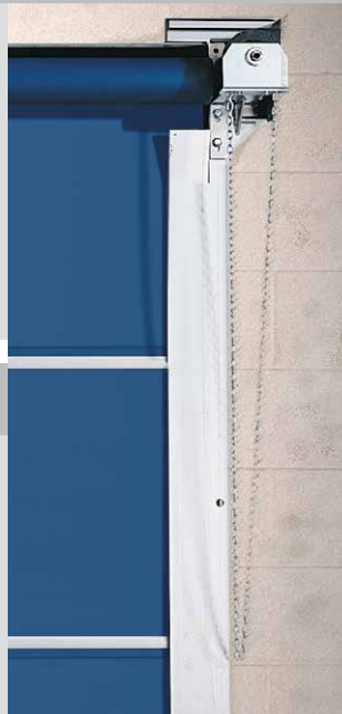
Manual chain hoist