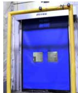
Shown with optional vision windows