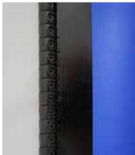
Durable drive teeth remain intact under high pressure