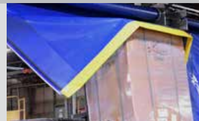
Panel resets if impacted