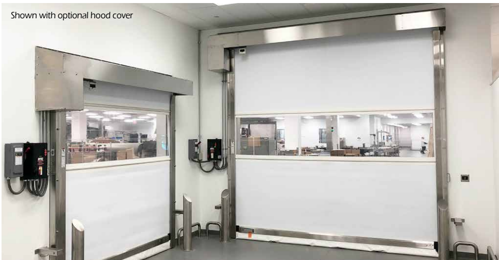
Shown with optional hood cover

Innovative engineering means the Pharma-Roll door provides all the maintenance-saving and efficiency benefits of a high-performance door while allowing for easy wipe-down cleaning.