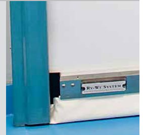
Ry-Wi Wireless System