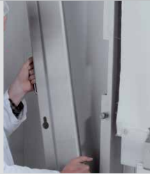
Edge-to-edge brush seal