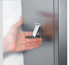
Flush manual release