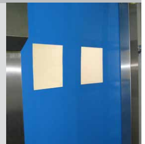
Shown with optional windows

Standard maximum sizes shown; larger sizes may be available upon request.