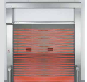
Ry-Beam Light Curtain