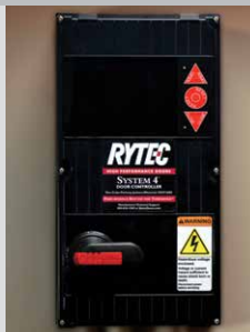
System 4 shown with optional rotary disconnect