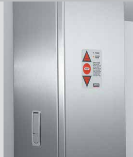
Flush membrane switch allows controls to be mounted remotely