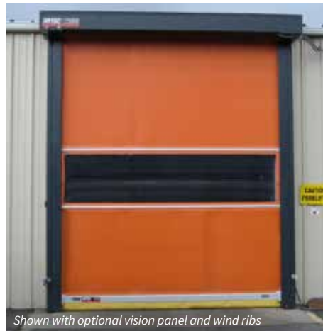
Shown with optional vision panel and wind ribs