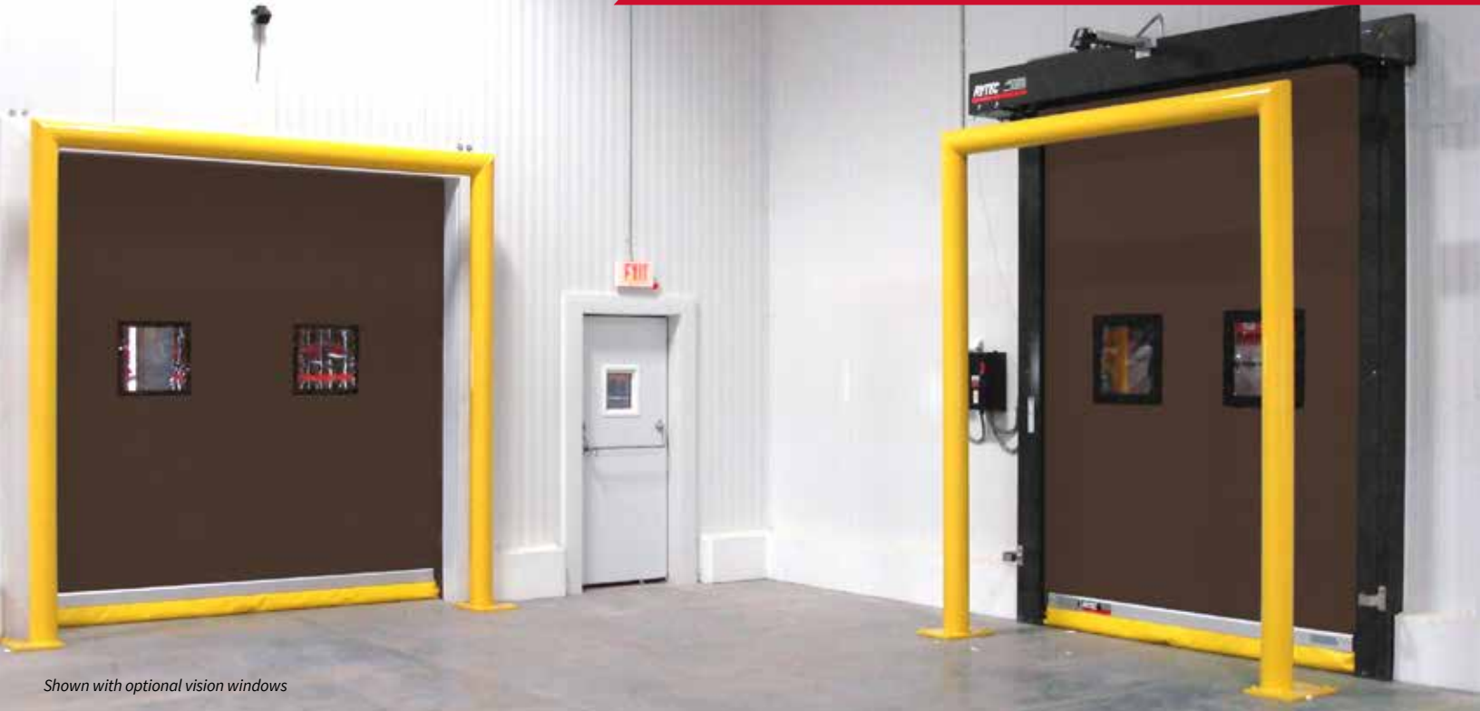
Shown with optional vision windows