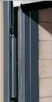
Counterweights within side column