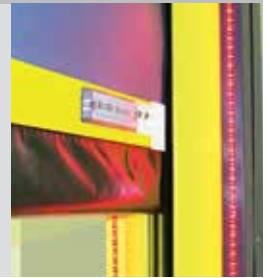
Pathwatch warning lights, Turbo-Seal Insulated pictured