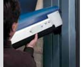
Break-Away tabs reinsert into side columns