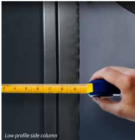
Low profile side column

Where traffic patterns near the doorway are tight and speed is critical, the Turbo-Seal ultra high-speed door is your best solution. Such situations tend to create greater potential for doors to get hit because of the relatively short approach to the door. The extra speed and low profile offered by the Turbo-Seal minimizes that potential by getting the door out of the way faster and requiring a smaller footprint.