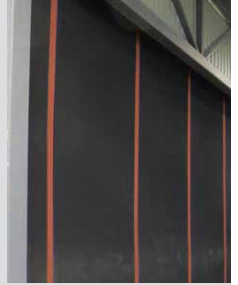
Vertical stripes for added safety