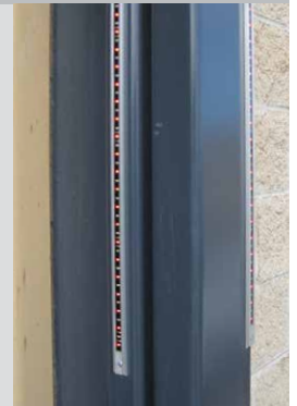
Pathwatch warning lights