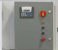
PLC Controller allows for fully customizable configurations for every application