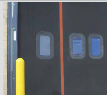
Window option shown

Standard maximum sizes shown; larger sizes may be available upon request.